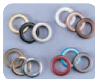
Rufflette Jupiter Rings Available colours -