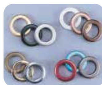
Rufflette Jupiter Rings Available colours -